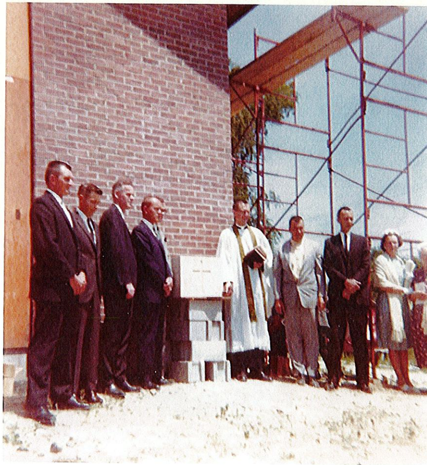
This color photograph shows the scaffolding on the east side of the church.

The Holy Scriptures, The Lutheran Hymnal, The Augsburg Confession, Luther's Small Catechism, Constitution of the Congregation, Membership Directory and Historical Material, Roll of Building Fund Contributors, The Lutheran Witness and The Lutheran Witness Reporter, The Lutheran Annual, The Union Leader, Various tracts and coins. The Handbook of The Lutheran Church-Missouri Synod.